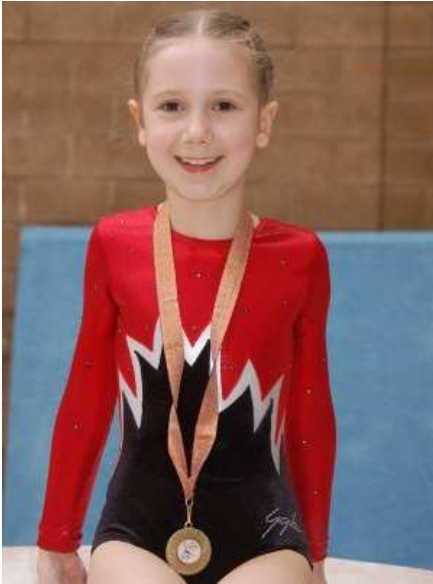
India, Bronze Overall