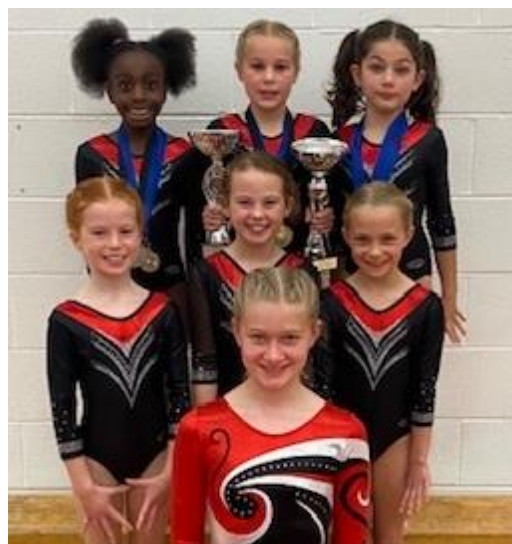
All gymnasts who competed in the North West and Greater Manchester Floor and Vault Championships.