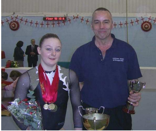
gional Teams final, the National Grades final and the Compulsories on the same weekend. Read about it on page 4.

As disclosed in the last newsletter the NDP grades for 2009 have changed and the WTC has decided how the competitions will be run. The regional Grades will all take place in the Counties with a Re-